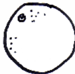
Oranges can be orange