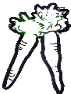
Carrots can be orange.