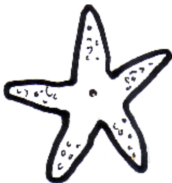
A starfish can be orange