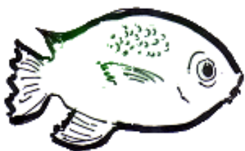
Fish can be orange.