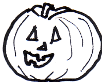
Jack o lanterns can be orange.