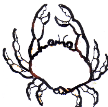
Crabs can be orange.